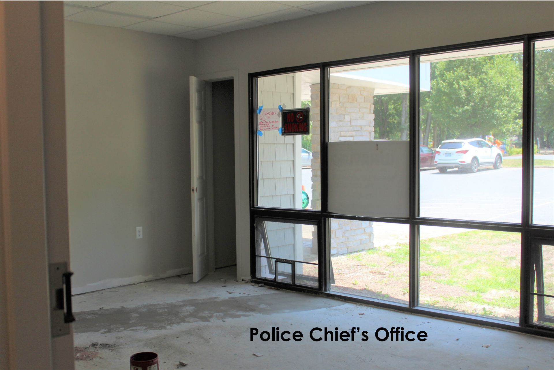
Police Chief's Office